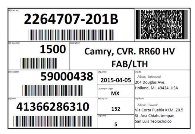
Label Examples with the 2D Barcode